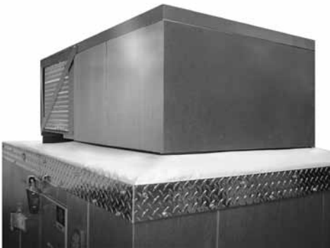
Exterior view of roof-curb mounting technology for drop-in refrigeration outdoor installations.

New Roof-curb Technology allows for trouble-free outdoor installation.