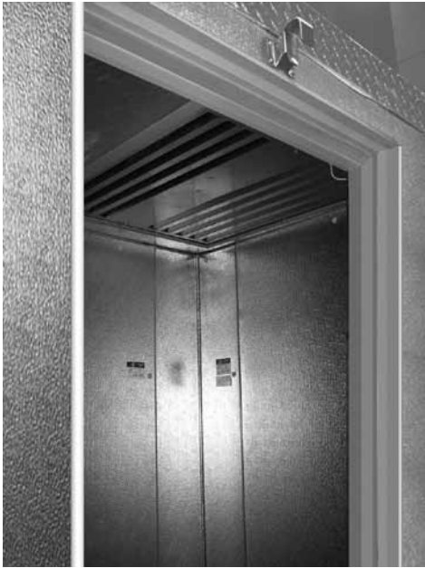
Top-mount refrigeration is flush to the interior.