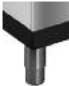
B-model bin leg