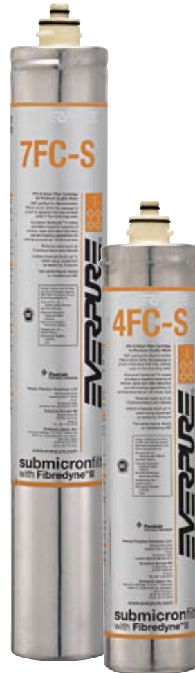
4FC-S Replacement Cartridge 1 PK: EV9692-31 7FC-S Replacement Cartridge 1 PK: EV9692-71

Always flush the filter cartridge at time of installation and cartridge change.