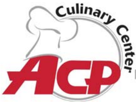
Table of Contents – Customer Applications