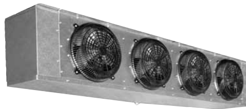
Kol-Flo Low Profile

EC = Electronically Commutated Motors SP = Shaded Pole Motors